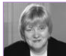
The Rt Hon Donald Dewar MP Secretary of State for Scotland

A handwritten signature in black ink, appearing to read 'Marjorie Mowlam'.