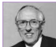
The Rt Hon Frank Dobson MP Secretary of State for Health

A handwritten signature in black ink, appearing to read 'Donald Dewar'.